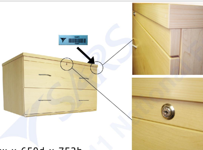
1200w x 650d x 752h 2 drawer Top Retrieval unit

FINISH Vancouver Maple 688 CDL (Deccon) Lo-glare, Glaze - Woodtext