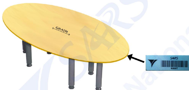
Typical 6 Seater Boardroom Table

NOTE: Chair type for Table-10 is CHAIR-01-M-X