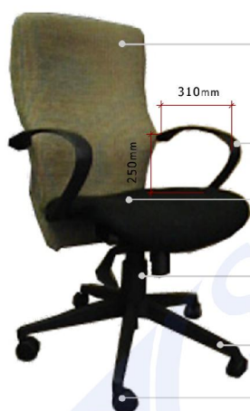
Standard Highback Chair

Code: CHAIR-02-H-X (where X = Fabric option)