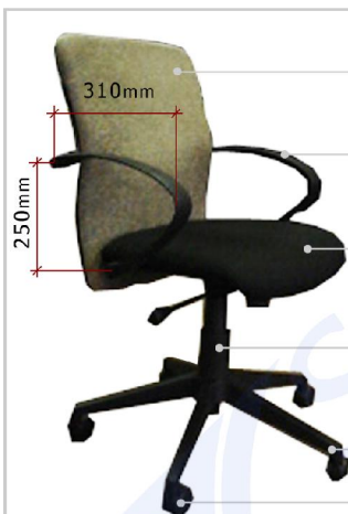
Standard Midback Chair

Code : CHAIR-01-M-X (where X = Fabric option)